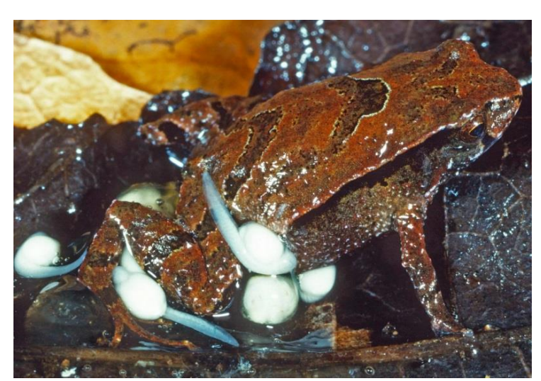
The well-camouflaged new frog species discovered in Wollumbin National Park in northern NSW.

Minister for Environment Matt Kean said the NSW government had taken immediate action to protect the tiny frogs, declaring their habitat an Asset of Intergenerational Significance under the National Parks and Wildlife Act to give increased protection.