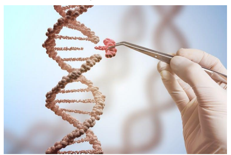
CRISPR technology could potentially be used to edit the genes of endangered species.

By bringing the concept of TGI to the attention of the public, government, and other scientists, we hope we will spur discussion and encourage research on its risks and benefits.