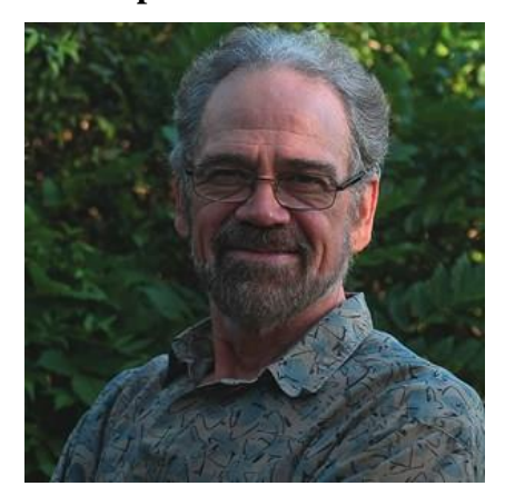
By Tim Low, Invasive Species Council cofounder, ecologist and author

Australia's extinction Record makes that clear. According to a 2019 journal article, 15 animals have been lost since 1960 and 12 of those extinctions can be blamed mainly on invasive animals and pathogens. The invasive species responsible include wolf snakes, chytrid fungus, foxes and cats.