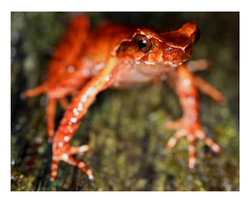
These discoveries, painstakingly identified and recorded by keen naturalists and taxonomists, and compiled here by WWF-Greater Mekong, demonstrate that the region is still a frontline for scientific exploration and a hotspot of species diversity.

However, these discoveries also are a stark reminder of what we stand to lose if human settlement and development activities in the region continue to destroy the natural environment.