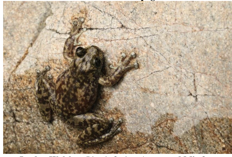
Jayden Walsh Litoria lorica Armoured Mistfrog

By 20/3/2022 FATS will have welcomed over 4,000 members to our Facebook page.