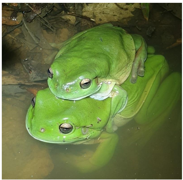
<u>Image:</u> Green Tree Frogs ( Litoria caerulea ) in amplexus.

since November, our team have been validating over 10,000 frogs each week. We really appreciate all your wonderful recordings. Please keep them coming to make important contributions towards frog conservation in Australia, and we will get back to you to confirm calling species as soon as we can. If you have any questions or concerns, please contact us at calls@frogid.net.au