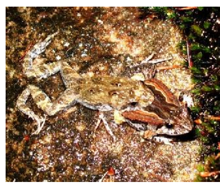
Crinia signifera in amplexus Many of the most impressive FATS talks are now given by members who are armed only with a sense of adventure and a cheap camera!

FATS MEMBERS It's time to look through your photos and submit a few to the 2013 Frog-O-Graphic competition which is closing very soon.