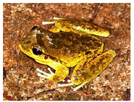
Male Litoria lesueuri