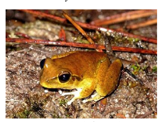
Male Litoria lesueuri