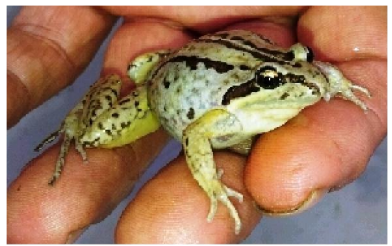
Striped Marsh Frog Limnodynastes peronii from Thornton near Newcastle. Probably coloured green by sitting in algae.