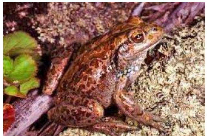
Spotted-thighed frog hops into SA

n unwanted visitor from the west has prompted environmental concern on Eyre Peninsula in South Australia. Authorities believe spotted-thighed frogs reached SA by road, in someone's vehicle. They are becoming established in the Streaky Bay area and a recent sighting was reported at Port Lincoln.