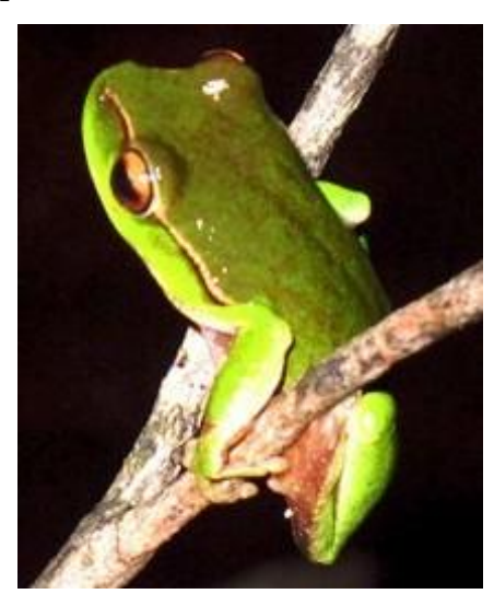
Litoria nudidigita http://frogs.org.au/frogs/species/Litoria/n udidigita/

The advances in affordable digital technology have seen photography become an important tool for wildlife researchers. Photography is now used extensively to identify wildlife, verify field records and to embellish scientific presentations.