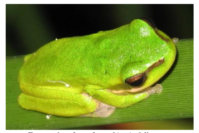
Eastern dwarf tree frog -Litoria fallax