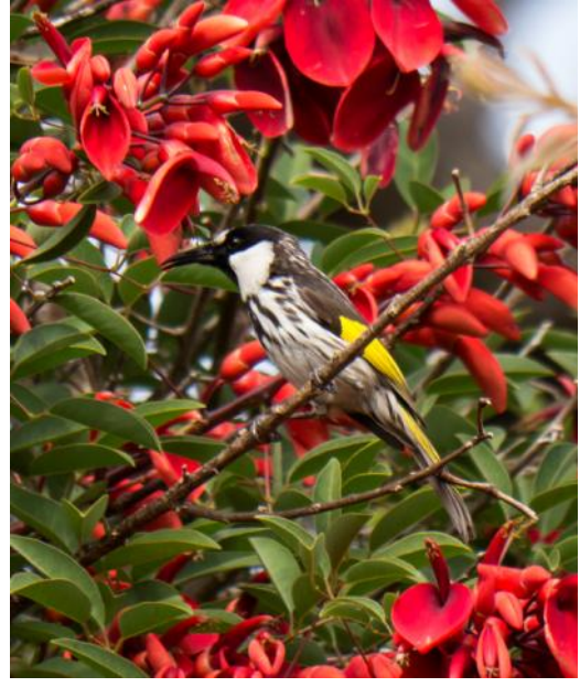
White-cheeked Honeyeater Smith's Lake Wood Swallow on nest FATS field trip