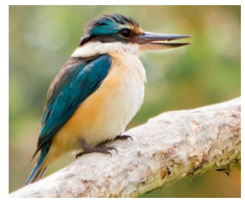
Sacred Kingfisher Smith's Lake field trip Kookaburra and nest 2012