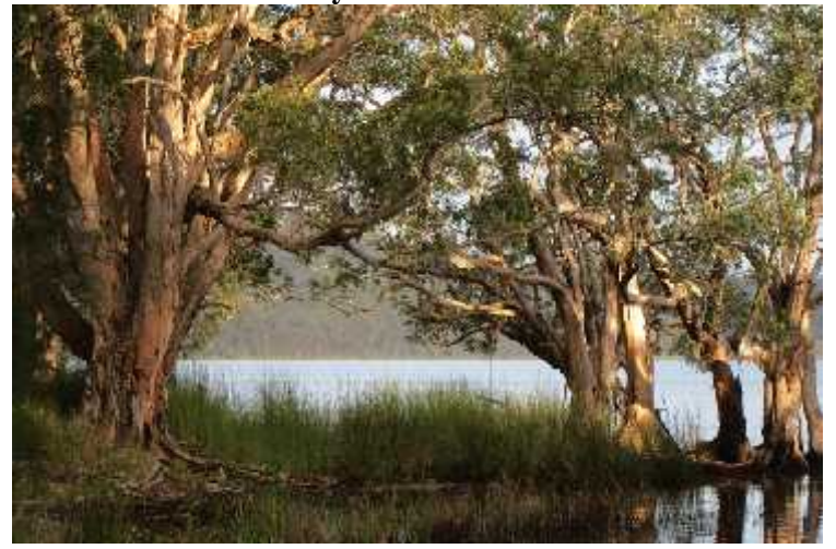
2012 FATS field trip - Smith's Lake in the early morning