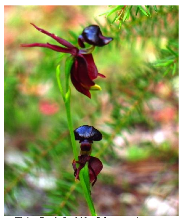
Flying Duck Orchid - Celeana major Smith's Lake field trip November 2012