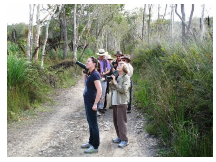
April 2013 P6