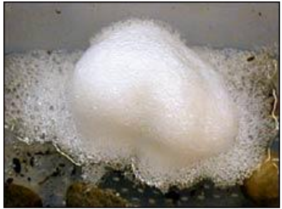
The nests are surprisingly tough despite their delicate appearance

Tungara frogs, like many frogs species, create foam nests to protect their young as they mature from eggs to tadpoles. But while these floating refuges look delicate, as if they could collapse into the pond they sit upon at any moment, they are in fact remarkably sturdy.