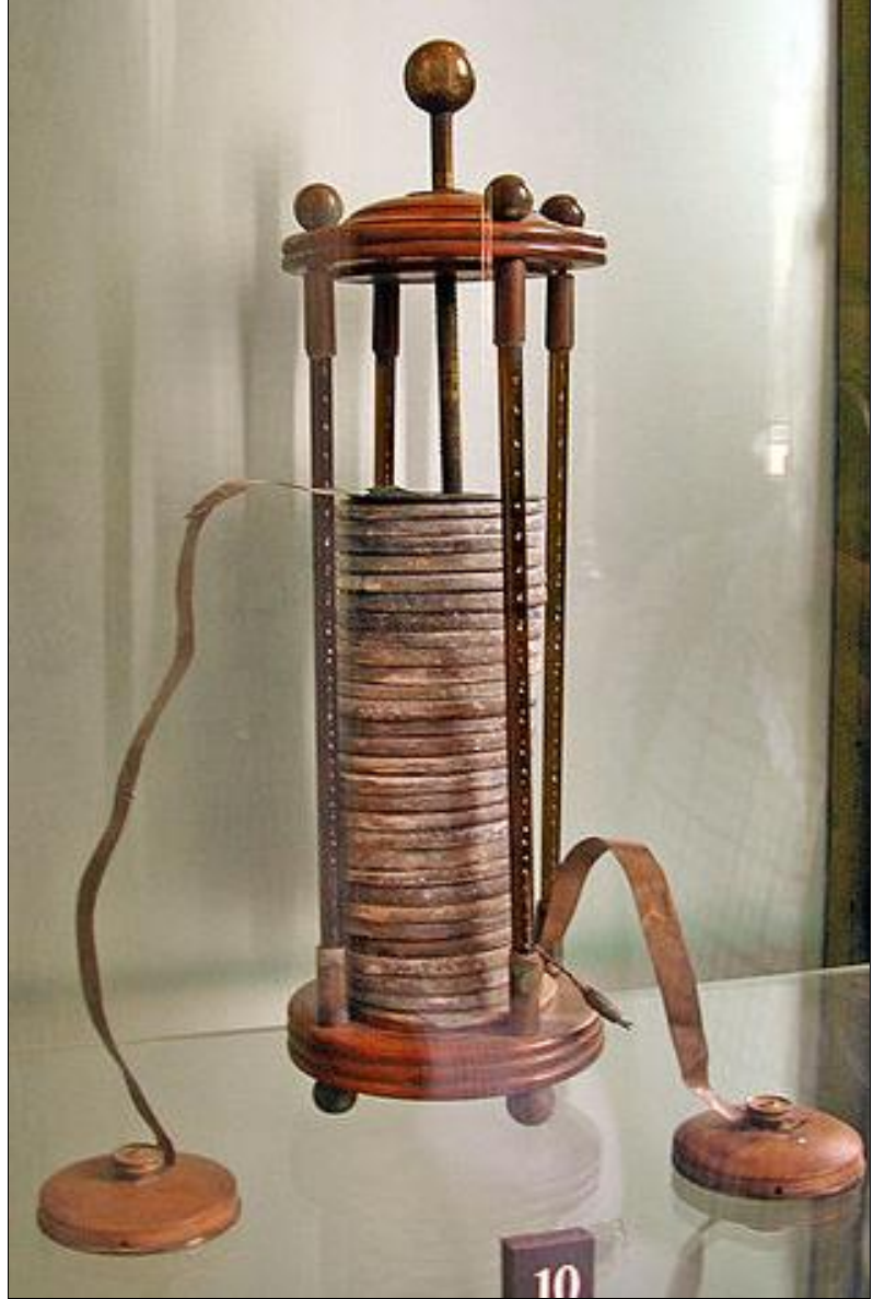
Figure 3. A battery (or voltaic pile) first built by Alessandro Volta. He used discs of zinc and silver, separated by cardboard soaked in brine. (http://en.Wikipedia.org/wiki/Alessandro_Volta)

Alessandro Volta, another Italian, read Galvani's work, and performed his own experiments with frogs. One of these involved using connecting wires of different materials e.g. tin and silver. He found he could produce the leg twitch without the external spark, and concluded that two different metals, joined by a conductor (the frog's leg) produced electricity. He went on to produce the first ever battery comprising a pile of alternating metal discs, separated by cardboard discs soaked in brine (Figure 3 below ).