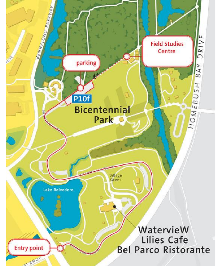
FATS meet at the Field Studies Centre Bicentennial Park

In the event of uncertain frogging conditions (e.g. prolonged / severe drought, hazardous and/or torrential rain, bushfires etc.), please phone 9681-5308. Remember ! - rain is generally ideal for frogging ! Children must be accompanied by an adult. Bring enclosed shoes that can get wet (gumboots are preferable ), torch, warm clothing and raincoat. Please be judicious with the use of insect repellent - frogs are very sensitive to chemicals ! Please observe all directions that the leader may give. Children are welcome, however please remember that young children especially can become very excited and boisterous at their first frogging experience – parents are asked to help ensure that the leader is able to conduct the trip to everyone's satisfaction. All field trips are strictly for members only - newcomers are however, welcome to take out membership before the commencement of the field-trip. All participants accept that there is some inherent risk associated with outdoor fieldtrips and by attending agree to; a release of all claims, a waiver of liability and an assumption of risk.