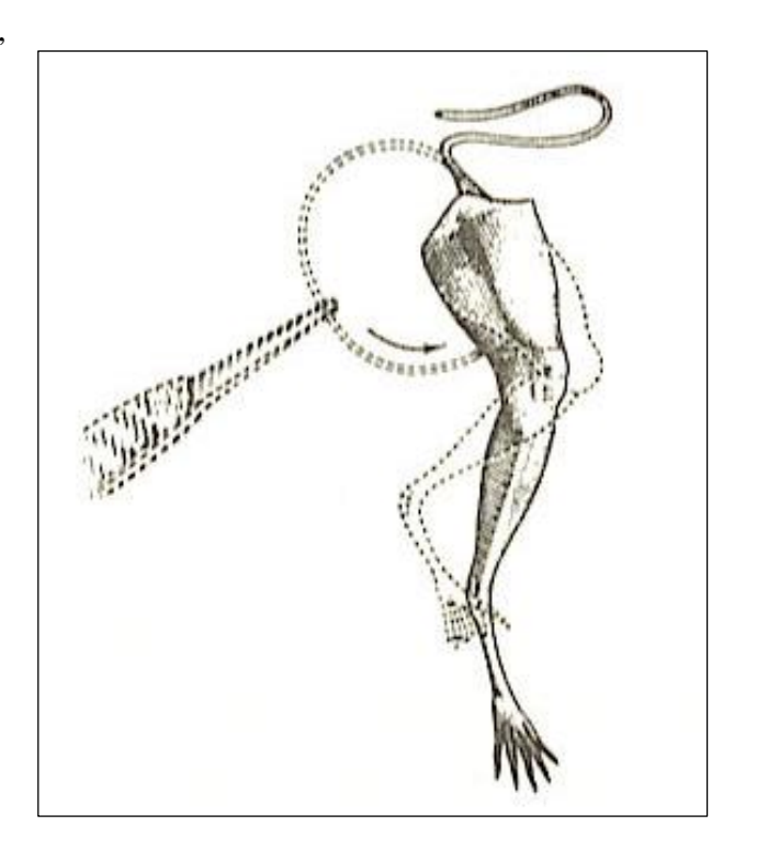
Figure 4. In later experiments Galvani showed that he could induce a leg jerk by simply touching the leg with its own nerve (Johnson, 2008)

Volta's work prompted Galvani to re-examine his experiments, and he found he could produce a leg twitch simply by touching the frog's leg with its own nerve (Figure 4 below). The parts of the frog's body were apparently acting as a source of electricity. Neither Galvani nor Volta could explain exactly what was happening, but we now know that each cell within an organism can act as a tiny battery.