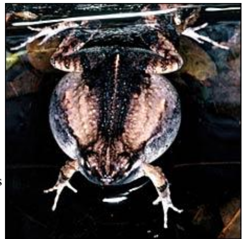
The Tungara frogs were caught on camera in Trinidad

By studying the footage. frame by frame, the researchers found that the small brown amphibians whipped up their nests in several phases.