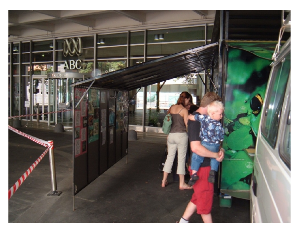
Learning his ABCs

Much enthusiasm, including for frogs, at a rekindled Waterwatch workshop on 23.5. at Boronia Park.