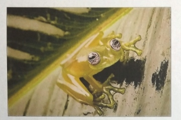
Hundreds of amphibian species will become extinct unless a global action plan is put into practice very soon, conservationists warn. (Image: Glass tree frog - R.D.Holt)

In some instances where the spread of this disease was rampant, conservationists would have little choice but to take an "ark" approach", said Dr Stuart. "The only option we have is to take the most vulnerable species out of the wild and put them in captive holding stations and breed them. It's being done in Panama and Colombia. Some of the rarest species are being plucked out before they go," he explained.