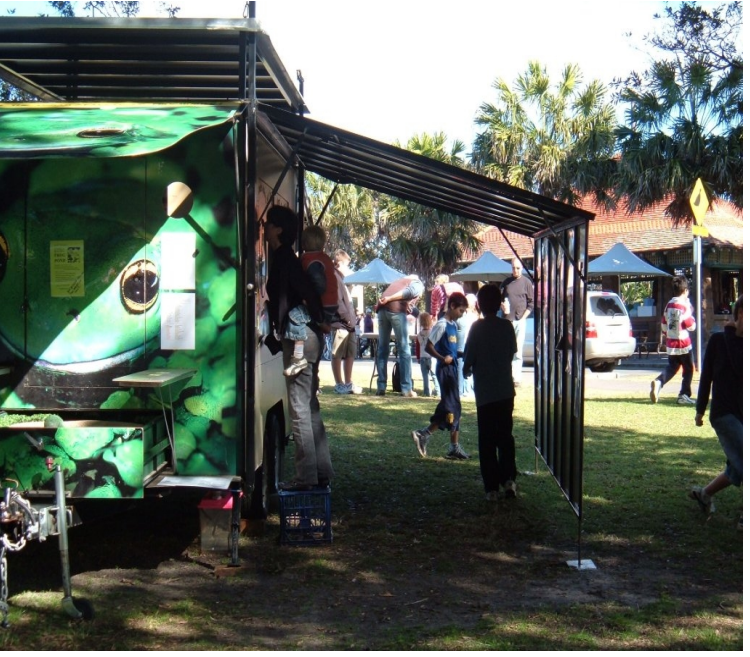
Counting the 10 Green Tree Frogs GREAT AUSTRALIAN BUSHWALK

"If it's an attractant we would be able to attract perhaps females in such numbers, that instead of having to go around and pick up one here and one there, we might be able to attract them together," he said. "It's a bit of a gamble, I admit it, but it's something that hasn't been tried and we're just keeping our fingers crossed that we'll have some luck." http://www.abc.net.au/news/newsitems/200605/s1644217.htm Forwarded on to FATS by Steve Weir