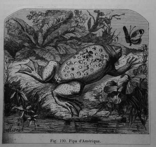
Tableau de la Nature, By Louis Figuier Ouvrage illustre a l'usage de la jeunese (Nature encyclopedia for young people) Paris 1876