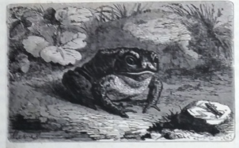
Tableau de la Nature, By Louis Figuier Ouvrage illustre a l'usage de la jeunese (Nature encyclopedia for young people) Paris 1876