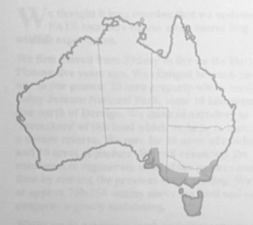
Litoria ewingi, Whistling Tree Frog or Southern Brown Tree Frog distribution