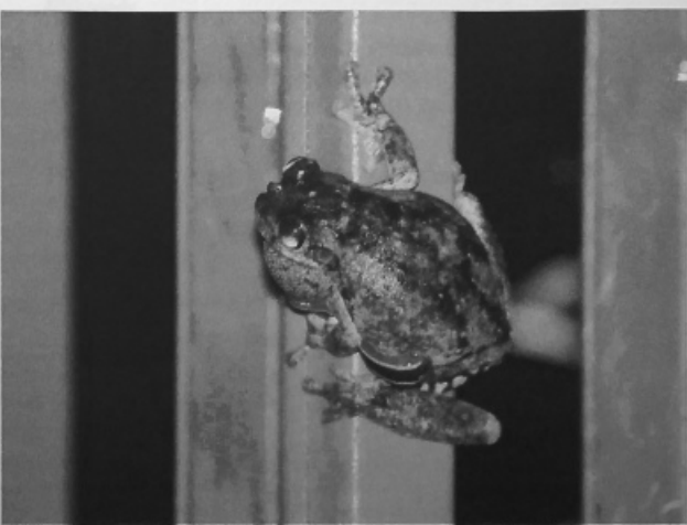
Peron's Tree frog with a leech hitchhiker.