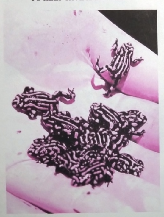
Go wild ... southern corroboree frogs take a moment before hopping off to a new life in NSW's Jagungal Wilderness region.

After three years in a refrigerated shipping container in Melbourne 200 desperately endangered corroboree frogs will see their first high-country dawn.