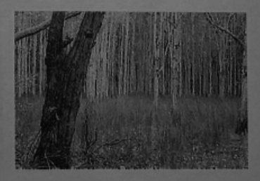
Site 8 - Tuckean Broadwater