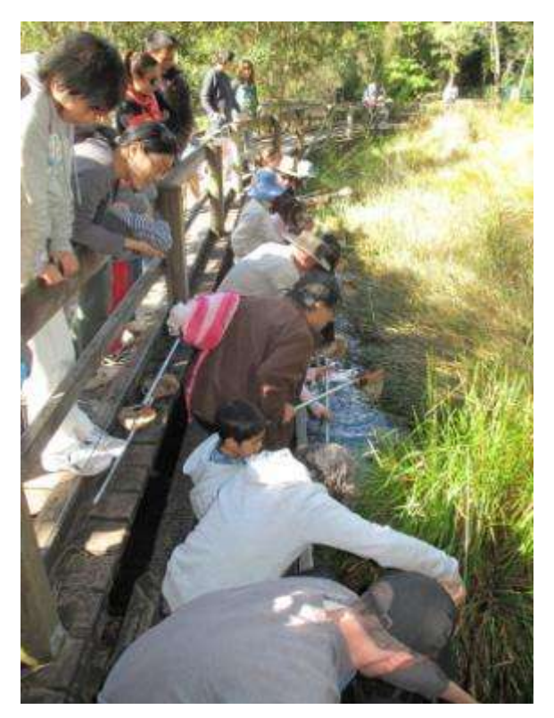
FATS SUCCESS AT THE KU-RING-GAI FESTIVAL OF WILDFLOWERS