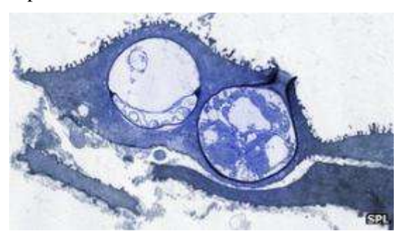
Bd spores spread from the skin of amphibians

Variable success Over the years, various teams of scientists have conducted a whole raft of experiments to find, for example, whether Bd is more active in warm or cold temperatures.