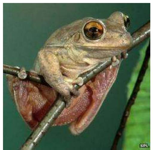
The Cuban tree frog is one of many species affected by the fungal disease chytridiomycosis

ore changeable temperatures, a consequence of global warming, may be helping to abet the threat that a lethal fungal disease poses to frogs. Scientists found that when temperatures vary unpredictably, frogs succumb faster to chytridiomycosis, which is killing amphibians around the world. The animals' immune systems appear to lose potency during unpredictable temperature shifts. The research is published in Nature Climate Change journal.