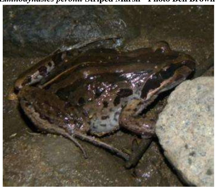
Limnodynastes peronii Striped Marsh

You need to photograph the frog untouched as much as you can, better never touch it unless you are wearing vinyl gloves, not latex or hand thoroughly disinfected with ethanol based non perfumed non oily disinfecting substance as it reduces zoonesis transference. The best position to get a photo of the frog as dorsolateral, for identification. The information that helps with identification is - locality, when and did you hear it call.