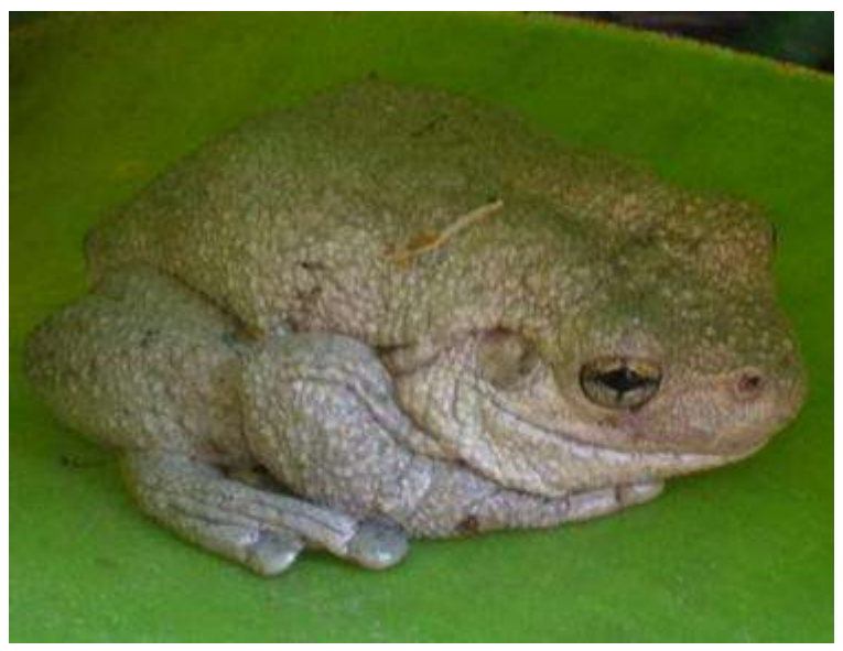
Litoria peronii Toowoomba Queensland