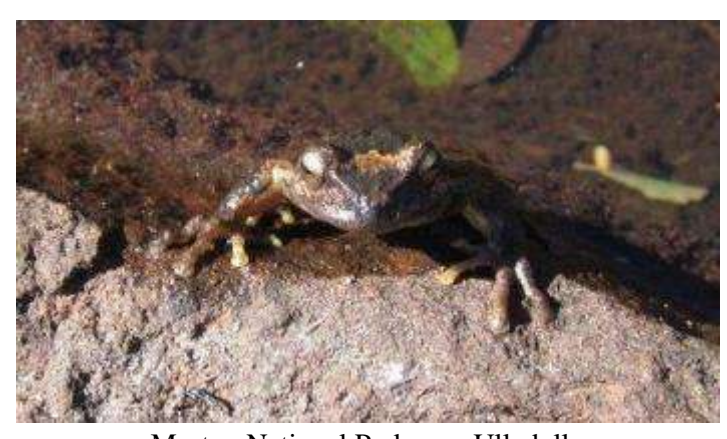
Morton National Park near Ulladulla Litoria littlejohni